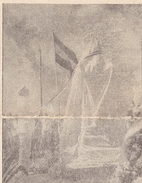
Climax of the ceremony is the unveiling of the statue.